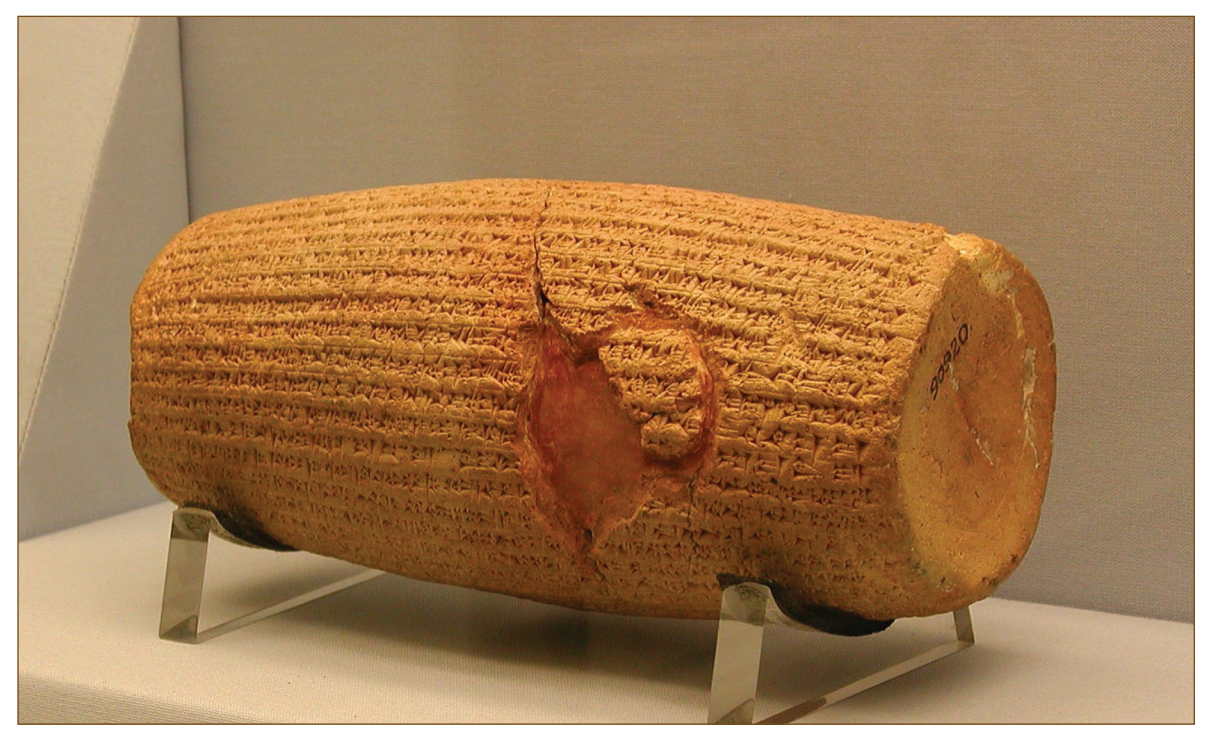
"By [Marduk's] exalted [word], ... I returned the (images of) the gods to the sacred centers [on the other side of] the Tigris whose sanctuaries had been abandoned for a long time, and I let them dwell in eternal abodes. I gathered all their inhabitants and returned (to them) their dwellings" (The Cyrus Cylinder). The Cyrus Cylinder provides King Cyrus of Persia's own account of his rise to power and of his restoration policy for all exiles (from the British Museum; translation from COS 315.28–36; cf. ANET 316). Significantly, what Cyrus attributes to "Marduk, the great lord of the gods" on the cylinder, the Bible rightly attributes to "the LORD, the God of heaven" (Ezra 1:2; cf. 2 Chron. 36:23).

LORD was on him/me/us" (Ezra 7:6, 9, 28; 8:18, 22, 31; Neh. 2:8, 18), and this same sovereign rule was testified to in the title "the God of heaven" that both Persian kings and Jewish leaders employed (Ezra 1:2; 6:9–10; 7:12, 21, 23; Neh. 1:5).