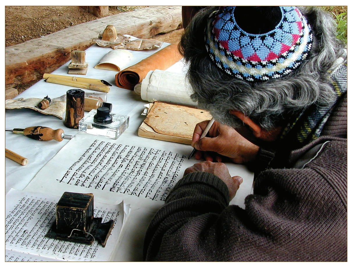
"Ezra had set his heart to study the Law of the LORD, and to do it and to teach his statutes and rules in Israel" (Ezra 7:10). A Jewish scribe writing.

One way Ezra-Nehemiah emphasized the revitalized focus on the centrality of Scripture was through highlighting the rebuilding of the temple and the reinstituting of the Levitical priesthood, the sacrifices, and the holy days (Ezra 3:2–10; 6:13–22; Neh. 8:13–18; 12:44–47; 13:4–9, 15–22, 28–31). These ceremonial or cultic laws helped distinguish Israel from the nations and provided parables of more fundamental truths about God and relating to him (see Col. 2:16–17; Heb. 9:11–14). Along with these more symbolic laws, God also called Israel to keep the various criminal, case, family, and compassion laws—all of which displayed love for God and neighbor in the community (see Fig. 3.4). The issues highlighted most directly in this book were the care of the poor and Levites (Neh. 5:1–13;